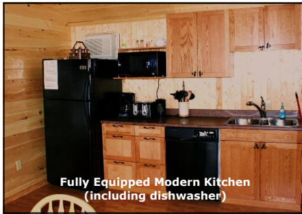
Fully Equipped Modern Kitchen (including dishwasher)