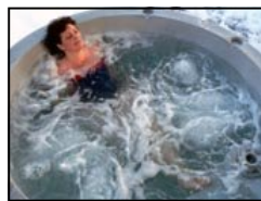
RotoSpa 5 - 6 person Hot Tub 14 Jets