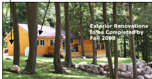
Exterior Renovations to be Completed by Fall 2008