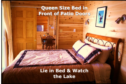
Queen Size Bed in Front of Patio Doors