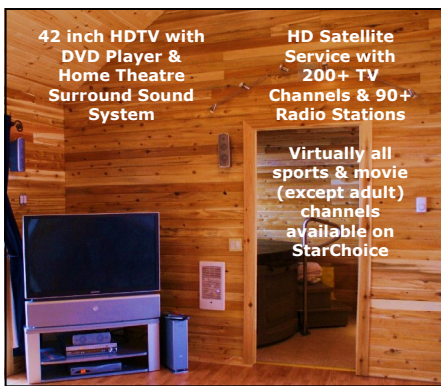
42 inch HDTV with DVD Player & Home Theatre Surround Sound System