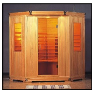
Royal Deluxe 4 Person Infrared Dry Sauna